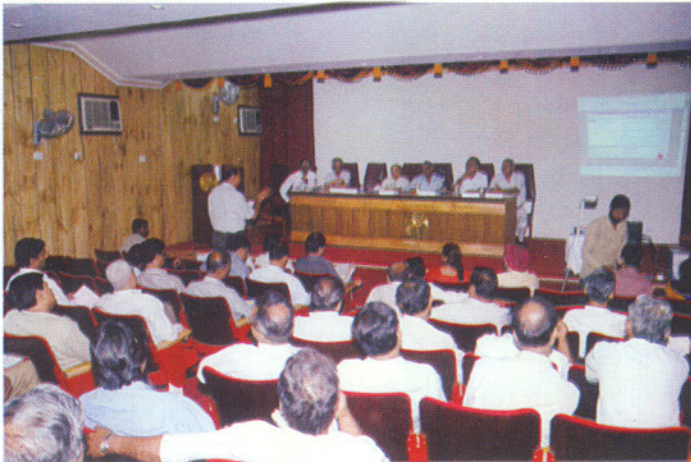
RAC meeting in progress ▲