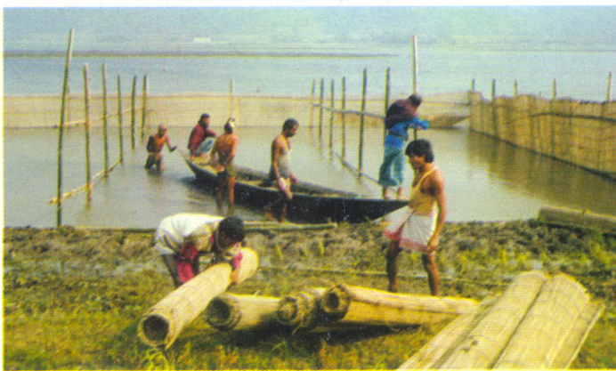
Erection of pens in the beels of Assam ▲

The North-eastern Regional Centre (NERC) of CIFRI, at Guwahati is the other co-operating centre where another activity of transfer of fish culture technology in pens is followed. Five beels, located in Golaghat, Nagaon, Morigaon and Goalpara districts of Assam have been adopted towards their fisheries enhancements under the activity.