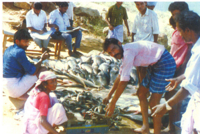
A tilapia dominated reservoir is now dominated by major carp ▲

A critical study of the fishery management in these reservoirs revealed that the seed of Cauvery carps stocked in the newly formed reservoirs did not establish, because the lacustrine environmental conditions were not conducive for these fishes. Introduction of the exotic fish, O. mossambicus in the 1960's changed the scenario of fisheries in the reservoirs of Tamil Nadu. This alien species grew fast, multiplied through its prolific breeding capacity and formed a major fishery. Since the fish attained a weight of > 1.7 kg in the initial years, it commanded a good market and fetched a reasonable price, hiking the production per unit area and the