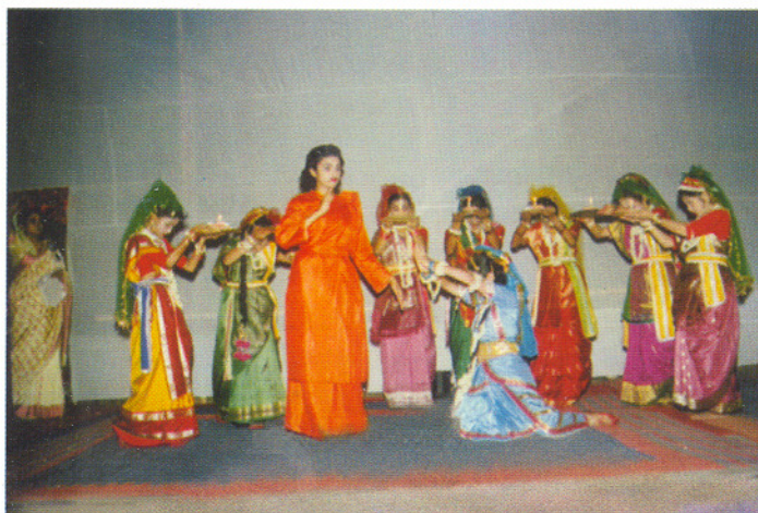
A scene from dance drama 'Abhisar' ▲