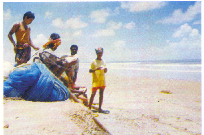
Mass awareness campaign of CIFRI ▲

Indiscriminate destruction of fin and shellfish seed in a vexing problem in Sundarbans. The Institute has been continuing its endeavour to create awareness on conservation through various extension activities viz., mass awareness campaign, group discussion, distribution of leaflets, coverage through mass media in the villages located near the estuaries/ coastal areas. Local civic body officials of the villages like panchayats have been involved to educate and motivate the seed collectors towards adoption of conservation measures. Impact of this endeavour indicates encouraging response from the clientele. Release of uneconomic species back to water after selecting the target species, P. monodon is one important conservation measure. The rate of adoption of this conservation measure bagda ( Penaeus monodon ) has increased from 17% last year to 23% this year.