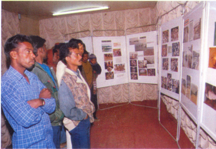
Fish farmers visiting CIFRI pavilion at Purulia ▲