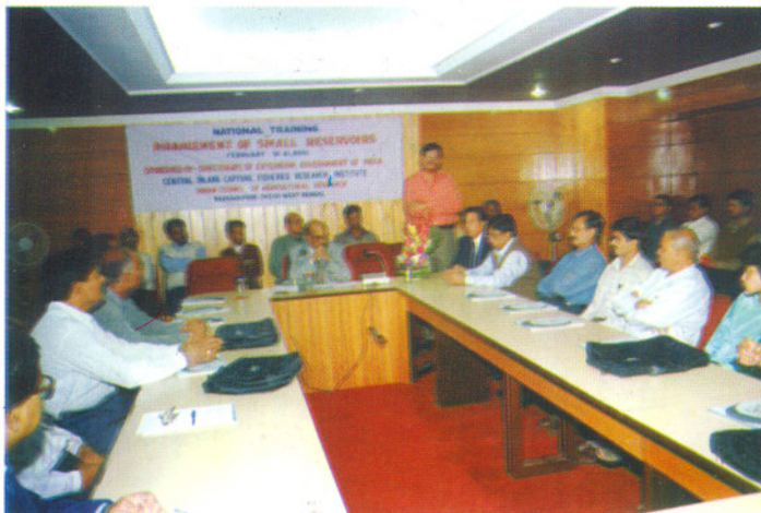
The training course in progress ▲