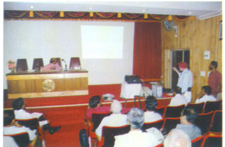
Presentation of projects in SRC ▲