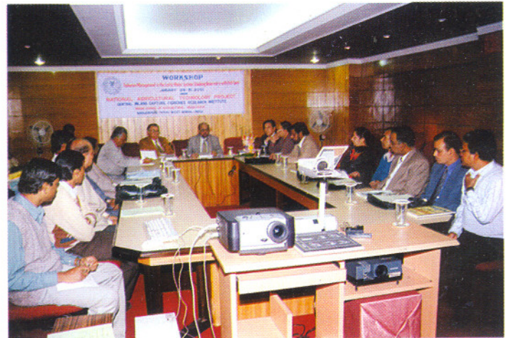
NATP workshop in progress at CIFRI, Barrackpore ▲

The experimental treatments are being carried out in the reservoirs of three different geo-climatic zones viz., Punjab, Uttaranchal and Madhya Pradesh under the management of the cooperating centres namely Punjab Agricultural University, Fisheries College, Govind Ballav Panth University for Agriculture and Technology and Jawaharlal Nehru Krishi Viswa Vidyalaya respectively.