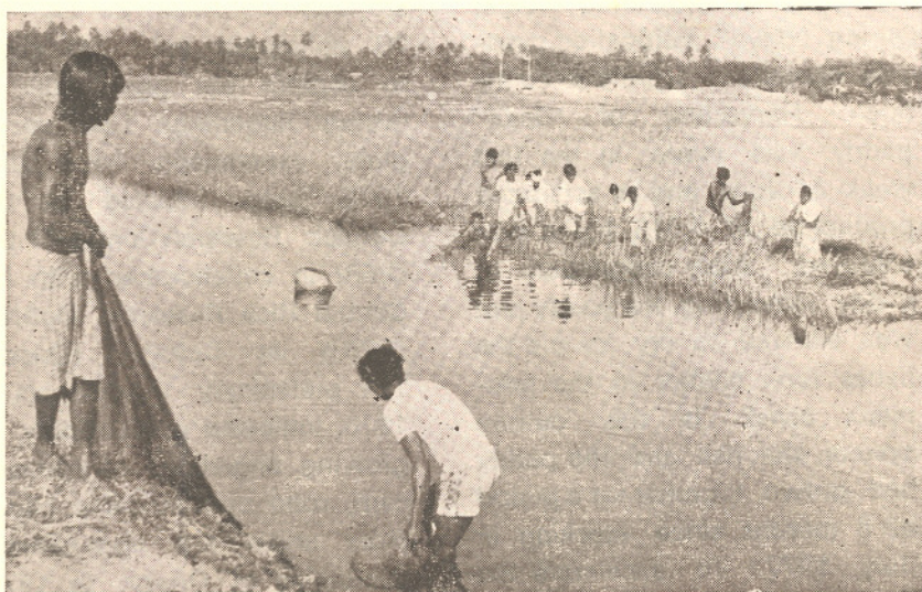
Paddy fields— a source of profitable fish culture for agriculturists. A scene from simultaneous harvesting of paddy and fish in progress at Rahara Research Centre (Khardah), West Bengal.

field. The top and bottom width of the canal, excavated for the purpose, was 6 m and