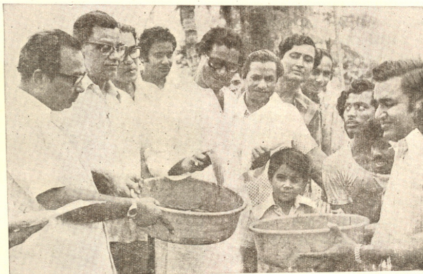
Shri Lilamoy Das, Minister for Fisheries, Government of Assam, appreciating magur ( Clarias batrachus ) raised at Hajo Fish Farm, Gauhati (Assam) under Air-breathing Fish Culture Project of the CIFRI.

results will give a great boost to the idea of rural development through integration of fish culture and animal husbandry and will open a new vista for rural employment as well.